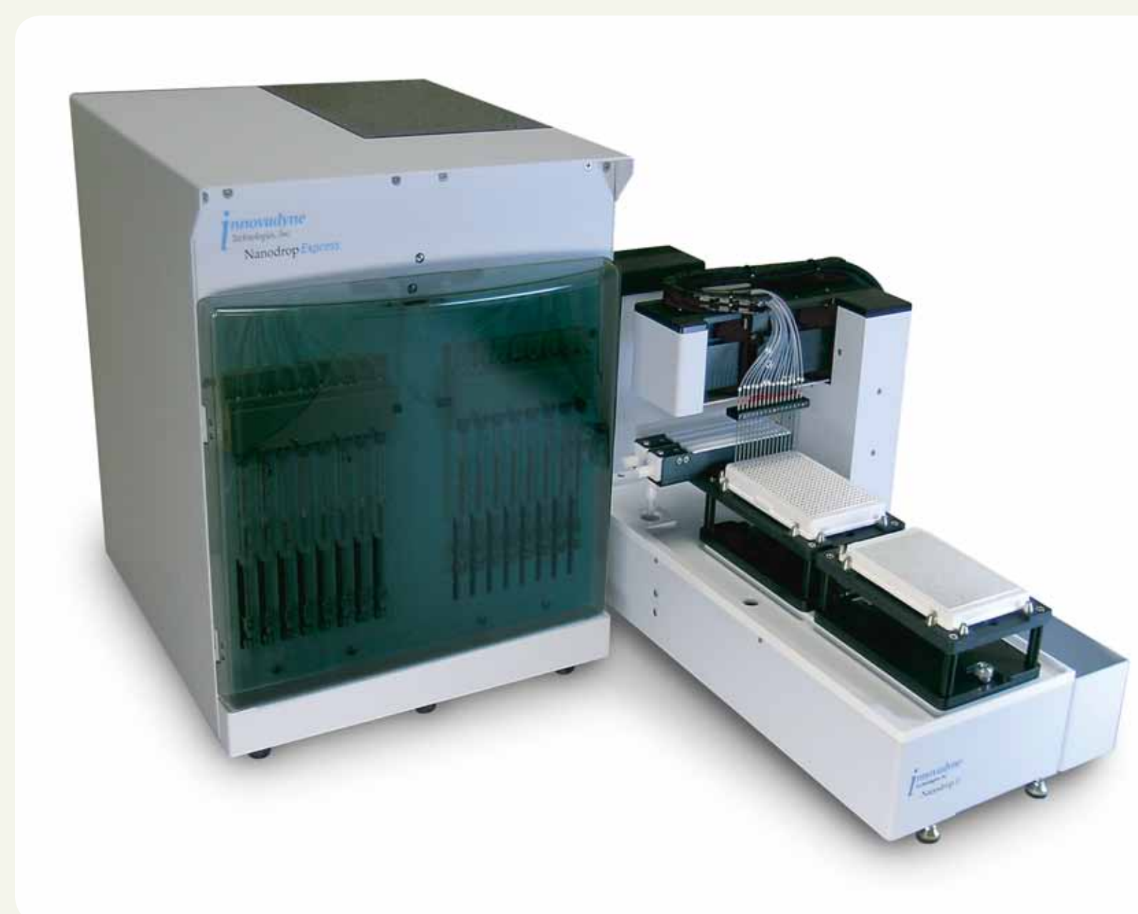
Nanodrop™ is a licensed trademark of IDEX Health & Science LLC.