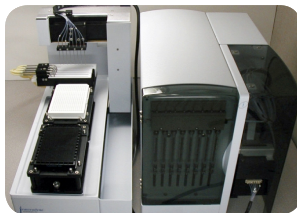
Nanodrop II Stage and Fluidics Module

The Innovadyne Nanodrop II is a complete solution for low volume, high-precision pipetting. The system can be configured with one or two plate positions to enable applications such as assay miniaturization, method development, PCR reaction setup, and protein crystallography. When a single plate nest is used, 4 individual tips can access any well of a standard SBS plate, enabling complex method development and design. The Nanodrop II aspirates and dispenses a broad range of liquids including DMSO and features the Nanobuilder software system that enables a wide range of applications and data manipulation. This patented technology isolates the solenoid dispense actuators from the sample path to assure long life and easy, low-cost maintenance.