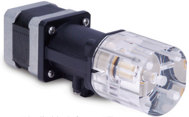
Value, Flexibility, Performance: VFP

For more information please contact Sapphire Engineering or your local OEM Representative.